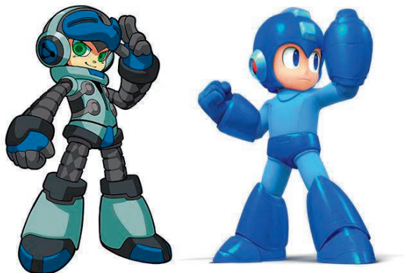
Left: Beck from Mighty No. 9 ; Right: Rock from Mega Man 142

respectively. 140 Both have a female robot companion; Rock's is named Roll, while Beck's is named Call. 141