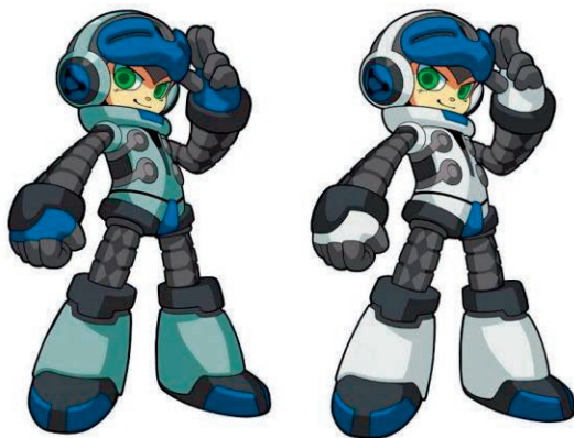
Left: early Beck design from Mighty No. 9 . Right: altered design for Beck. 145

Mega Man 's Rock is primarily known for his blue colored costume. 144