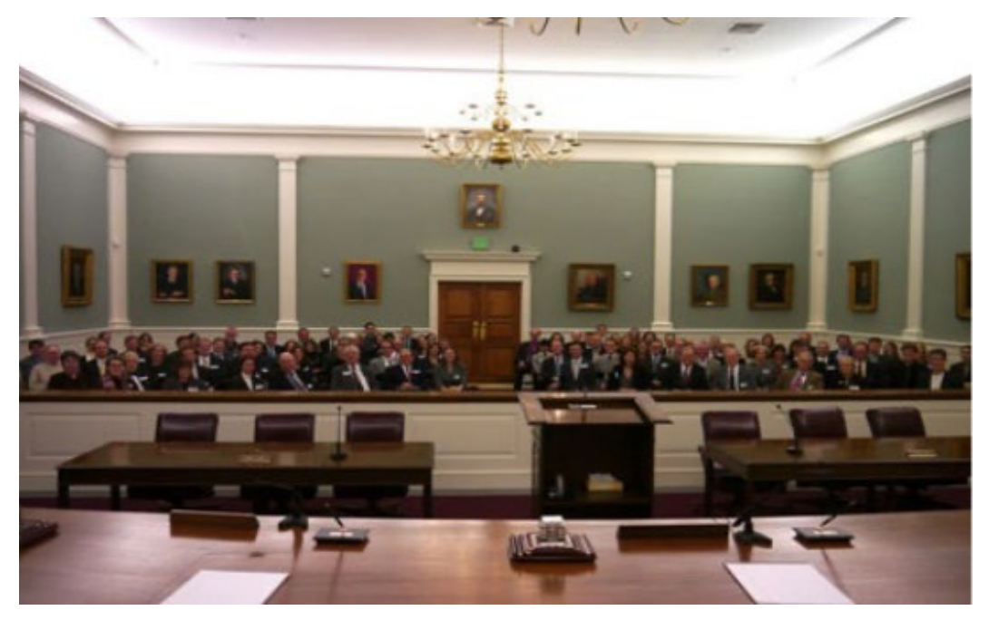
Interior of the N.H. Supreme Court.