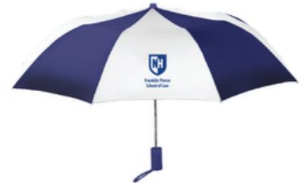
UNH Law Umbrella