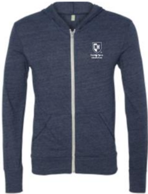
Eco-Jersey Zip Up Hoodie