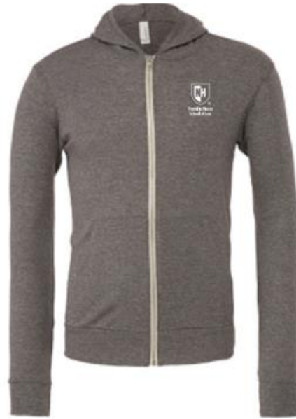
Eco-Jersey Zip Up Hoodie