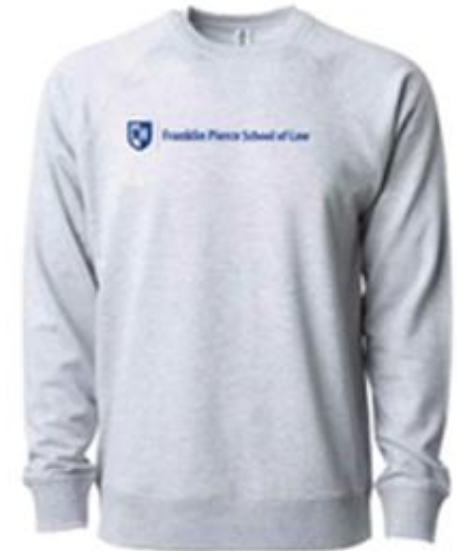
Light Weight Crewneck