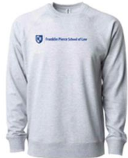
Light Weight Crew Neck