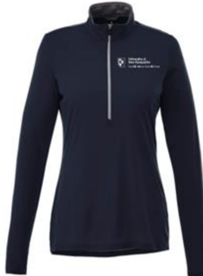
Women's 'School of Law' Quarter Zip