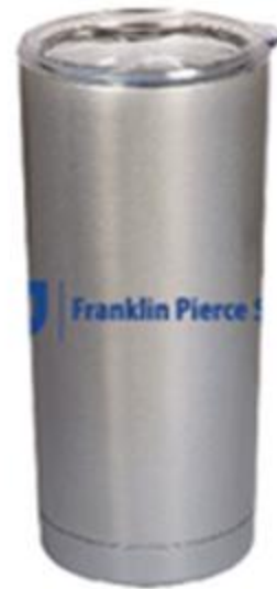
UNH Franklin Pierce Silver Tumbler