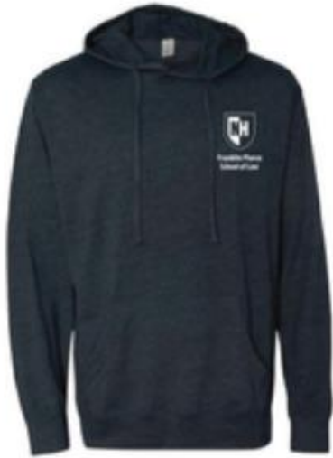
Lightweight Hooded Pullover