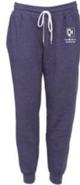
Unisex Navy Jogger Sweatpants W/ Pockets