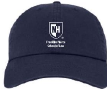
UNH Law Hat - $20 Colors Available: Navy, White, Light Pink