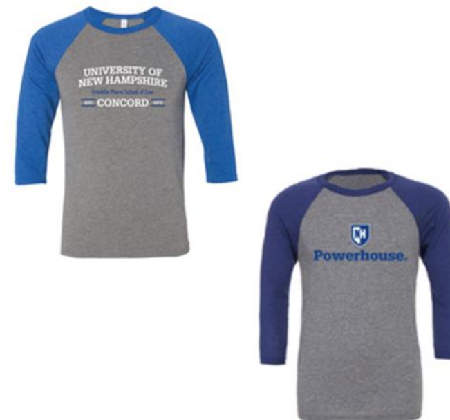
Concord / Powerhouse ¾