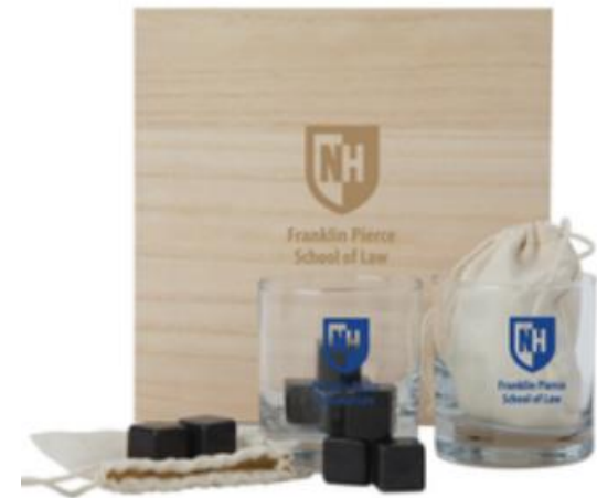
Speakeasy Gift Set