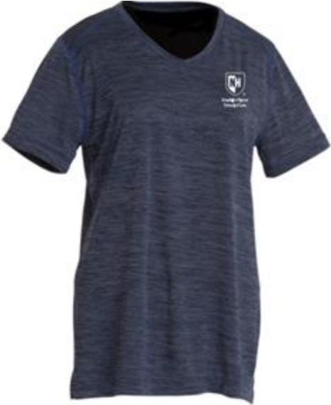
Ladies SportTek V Neck