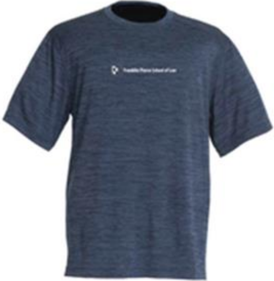
Mens Space Dye SportTek