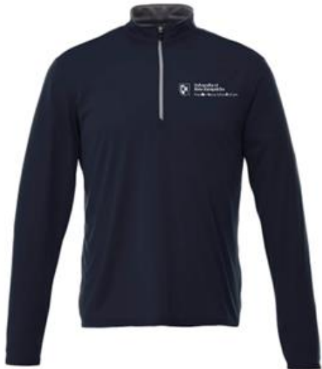
Men's 'School Of Law' Quarter Zip