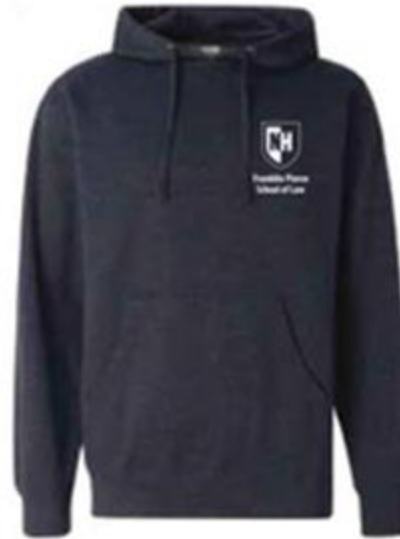
Midweight hooded Pullover