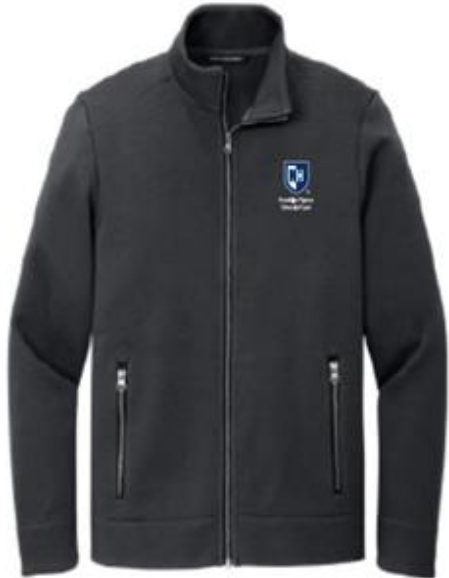
Port Authority Network Fleece Jacket